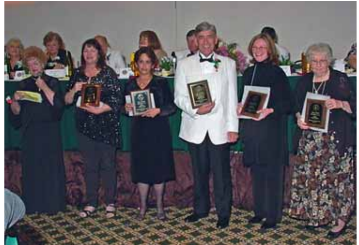
City of Hope winners this reporting period were Foothill (Division 1), Lakehead (Division 2), Weaverville (Division 3), Paradise Ridge (Division 4), and Mountain (Lioness). Contributions received so far this year total $12,031.84 to this important cause.

"Character cannot be developed in ease and quiet. Only through experience of trial and suffering can the soul be strengthened, vision cleared, ambition inspired, and success achieved." - Helen Keller